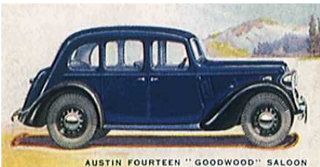
AUSTIN FOURTEEN "GOODWOOD" SALOON

He saw her beauty And made a bum's rush She saw his stubble And gave him the brush. And gave him the brush. Burma Shave