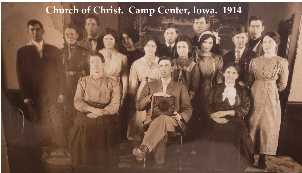
Church of Christ. Camp Center, Iowa. 1914

1914--Bible Reading at Camp Center Church of Christ.