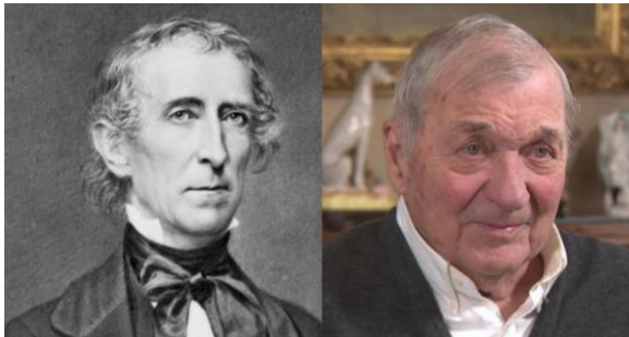
John Tyler 1790 – 1862