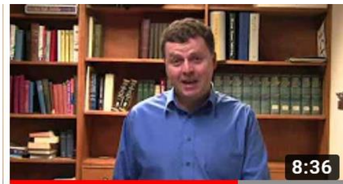
You Cannot Serve God and Mammon