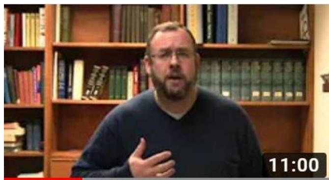
What is the Church?