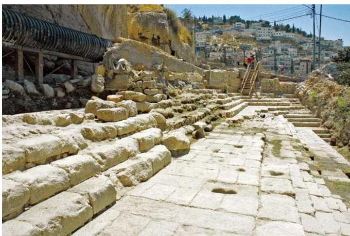
In 2004, the stepped remains of the ancient Siloam

Traditionally, the Christian site of the Siloam Pool was the pool and church that were built by the Byzantine empress Eudocia (c. 400–460 A.D.) to commemorate the miracle recounted in the New Testament. However, the exact location of the original pool as it existed during the time of Jesus remained a mystery until June 2004.